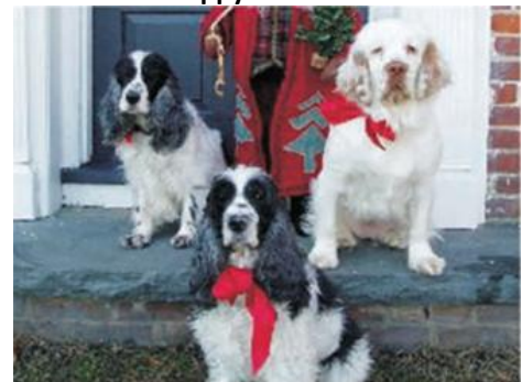
Springer Spaniels and a Clumber (in white)

For further information or assistance, please contact the regional Co-Chair in your area