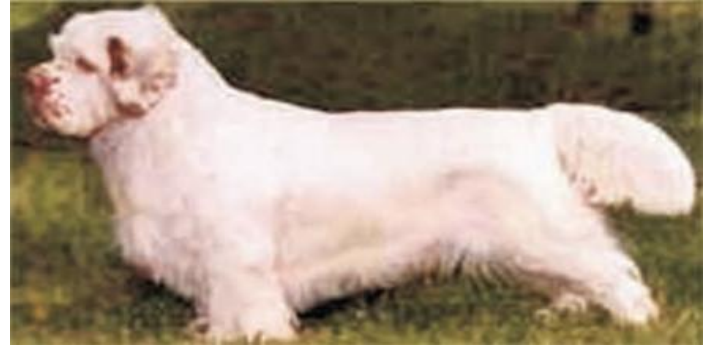
Male Clumber with undocked tail