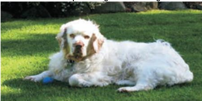
Favorite Clumber pose