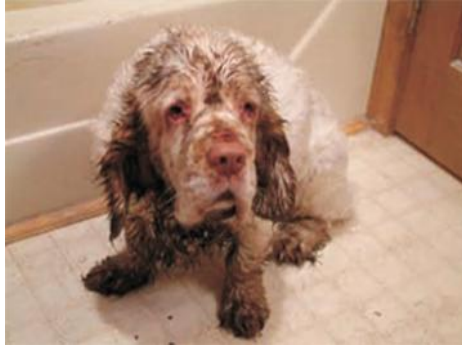
Yes they can get dirty