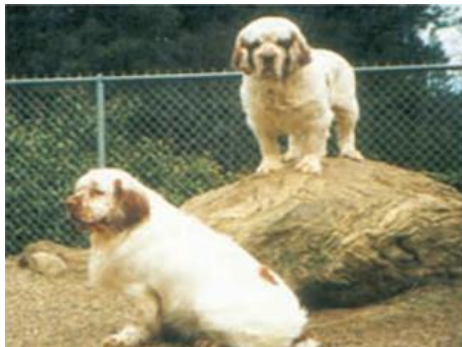
Clumbers pretending to be watchdogs