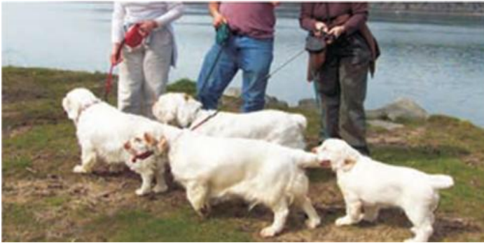
Two females, a male and a puppy bringing up the rear