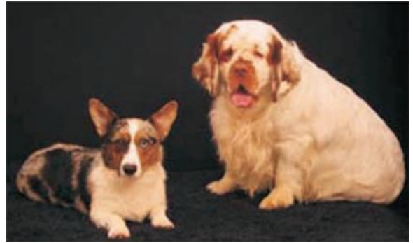
Male Clumber with a Corgi